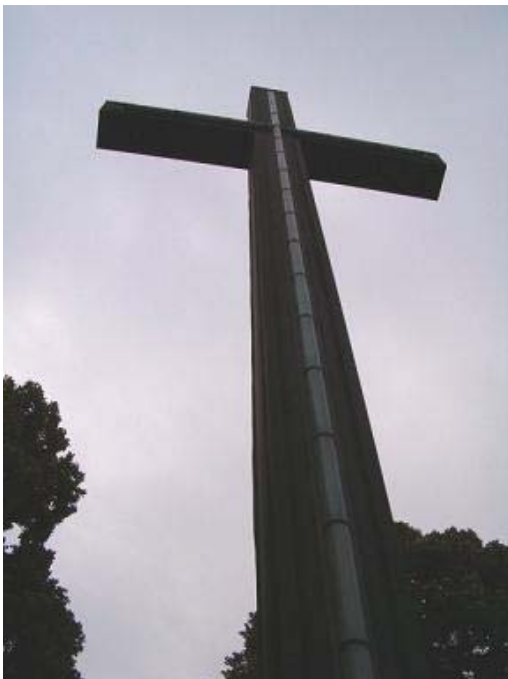
This immense cross on the Hülfensberg was erected in 1933 in remembrance of Bishop Conrad Martin. It is impressive that it was not put away neither by Hitler nor by the Communist regime.