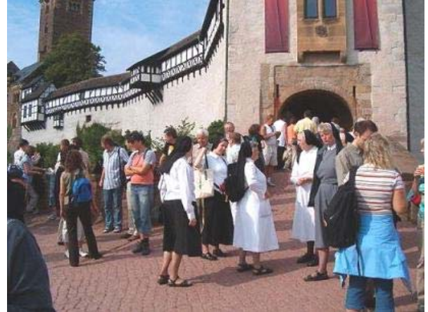
Die Wartburg (12 th Century)